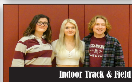
Indoor Track & Field