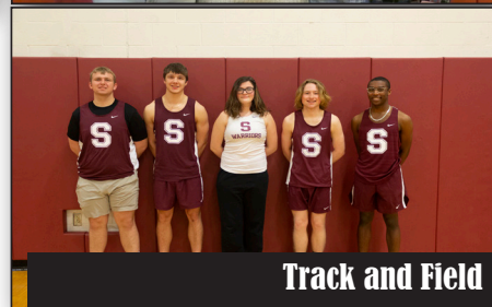
Track and Field